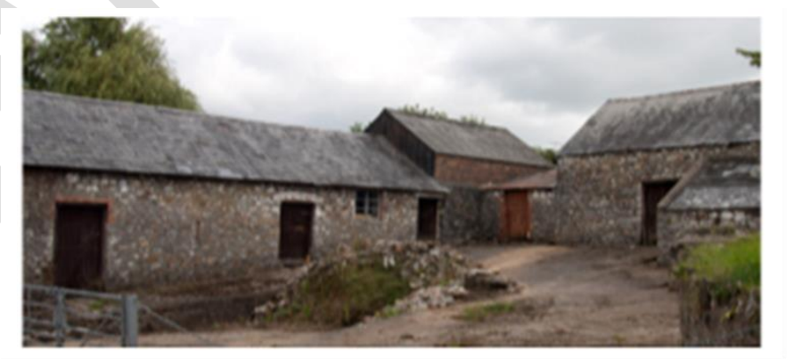
Above : A photograph of a group of farm buildings suitable for conversion