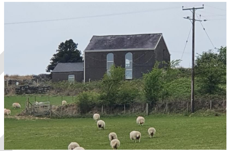
Above: Example of a traditional rural building, former Gerazim Chapel, Felindre