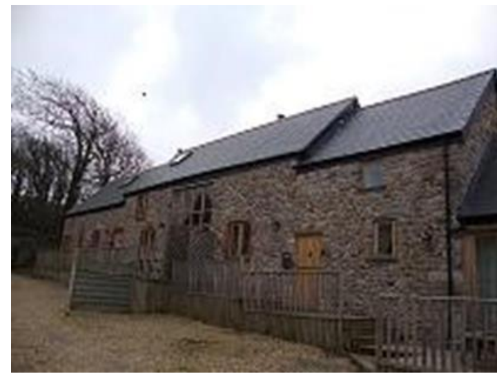
Above: Conversion of former barns, Church Barns, Llanmadoc